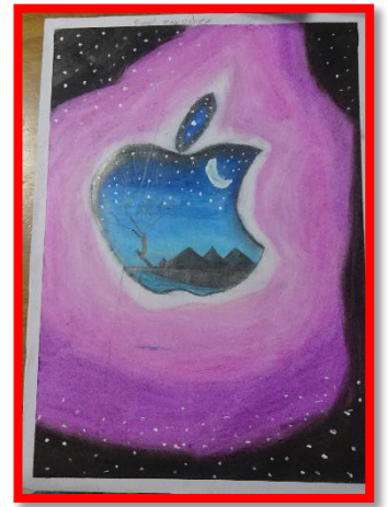
Manusree - VIII B