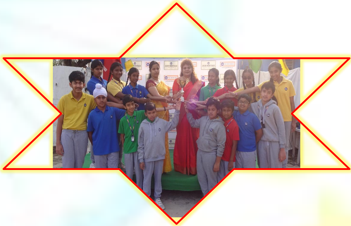
Grade – VI A (Senior)