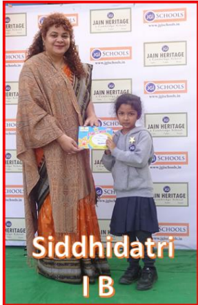
Siddhidatri I B