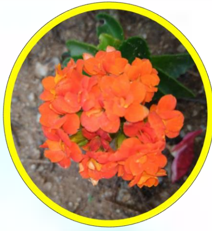
Shamita – VIII B