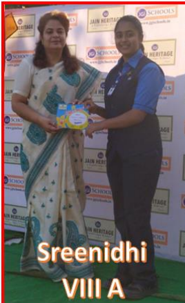
Sreenidhi VIII A