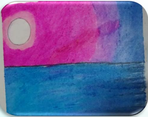
Ridhi - V B