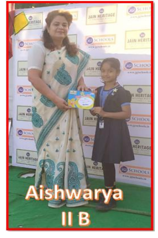
Aishwarya II B