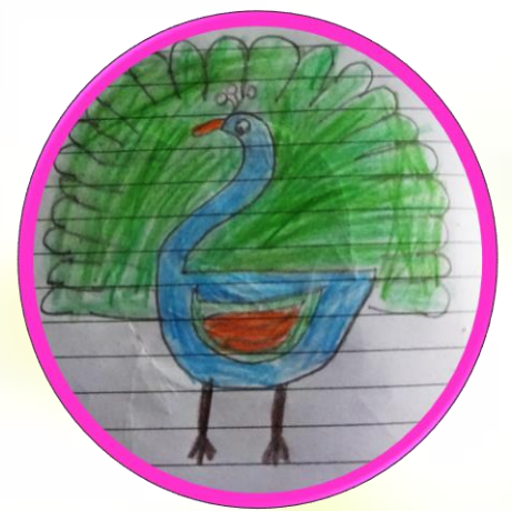
Srijayan - IV A