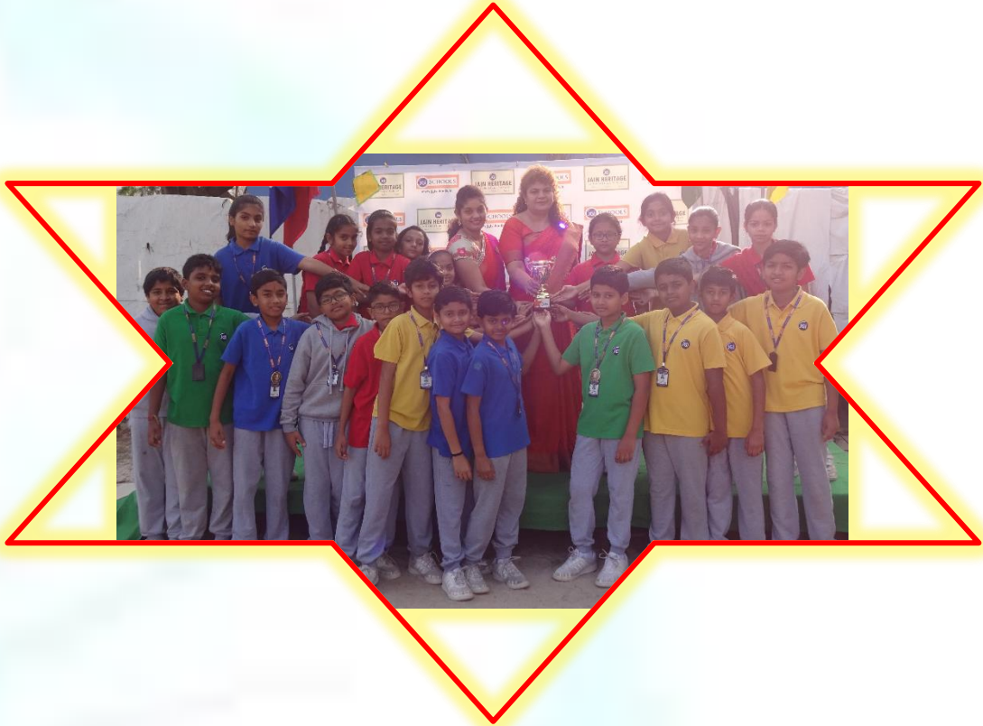
Grade – V B (Junior)