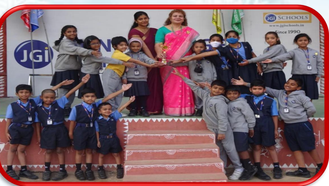
Grade- II B (Junior)