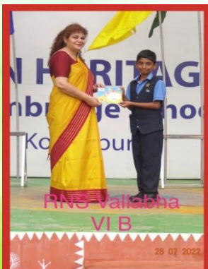
RNS Vallabha VI B