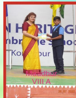
Maadhur VIII A