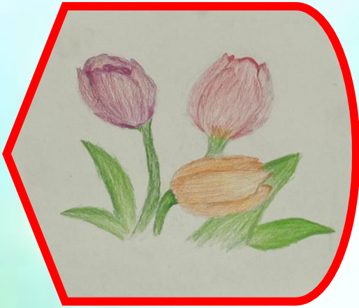
Kimaya V B