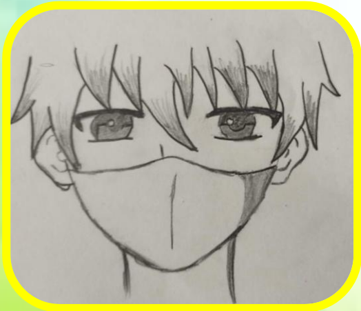
Pruthvi X A