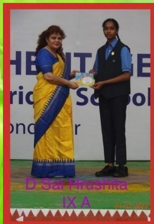
D Sar Hrashta IX A