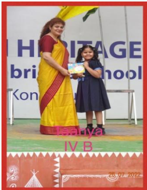
Harsha IV B