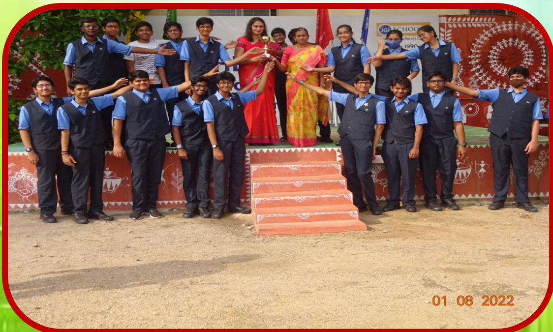
Grade- X B (Senior)