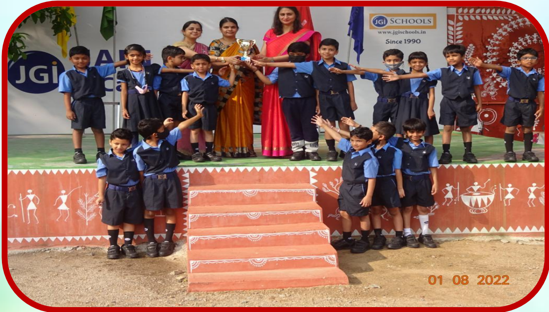
Grade- II A (Junior)