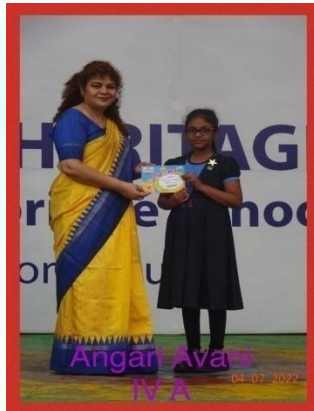
Angan Avani IV A