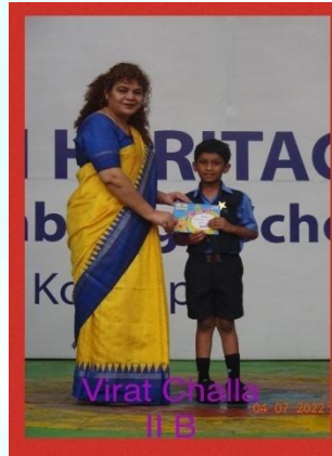
Virat Ghalla II B