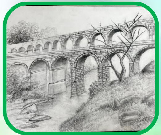
Gokshetra VIII A