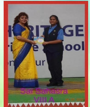
Sar Sahasra VIII A