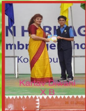
Katar Dhwani X B